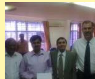
MOU with Oklahoma State University, USA

-3rd May 2010: Students participated Management fest, HMSIT, Tumkur, and won the Overall championship trophy at the Fest.