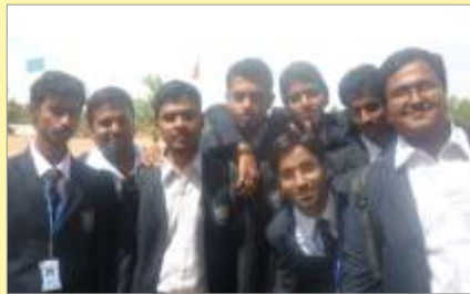
Feeling and Expression