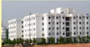
In-campus Hostel Facility