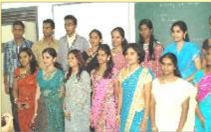
Few First year Students