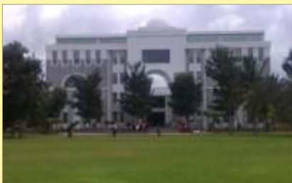
Centralized Digital Library