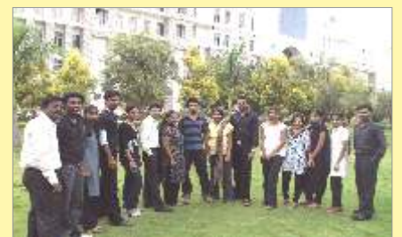
Alumni students of RITM- 2009-10 and the current final year students of MBA