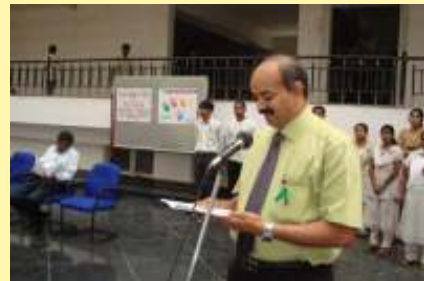
Global Hand Wash Campaign in the presence of Principal and Dean