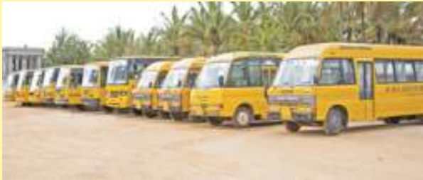
Reva Buses all over Bangalore City

Reva boasts of sprawling campus of 35 acres with greenery, which houses Main College Building, Central Library, Hostels and Staff Quarters. Reva ITM provides world class education, fosters Research and Development, encourages entrepreneurship and ultimately moulds young people in to professionals capable of assuming leadership of the society for the betterment of the country.