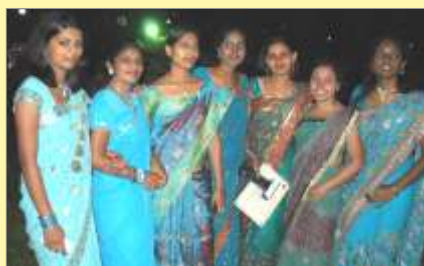
Few Post graduate girl students showcasing their happiness for being studied in RITM during Ring presentation day