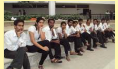
Professional development- Students