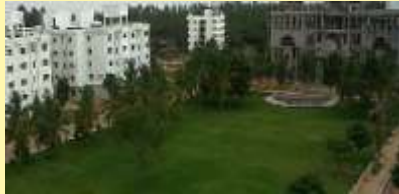
Open Air Theater