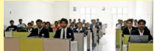
24X7 internet connected class rooms