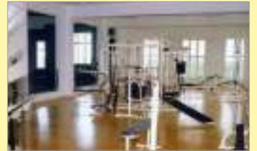
Indoor Sports facility with the Gymnasium