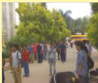
Everyday National Anthem