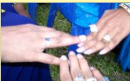
REVA rings shine in the hands of Graduates