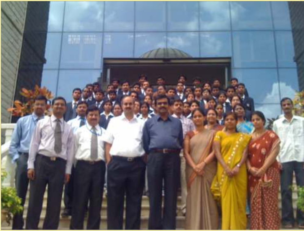
MBA Family of REVA ITM